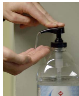
March Air Reserve Base