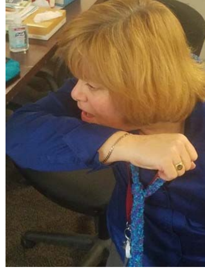
Minot Air Force Base

This keeps any germs I might have from spreading to other people.